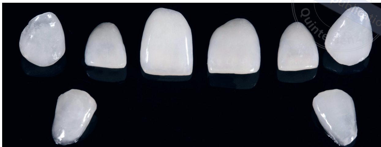
Fig 19 Anterior veneers fabricated from LS2 and feldspathic ceramic.

light-curing resin cement utilized (Variolink Esthetic LC – light). Figures 20 to 22 show the final aspect of the patient's smile.