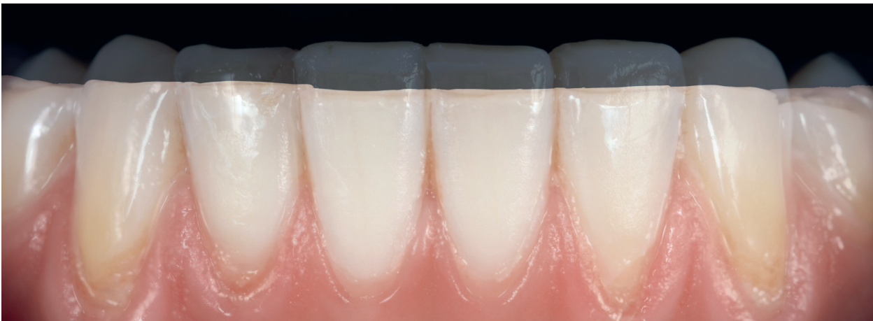
Fig 9 Therapeutic mock-up superimposed on the pretreatment situation, showing the contrast between the patient's tooth condition and the planned restorations.