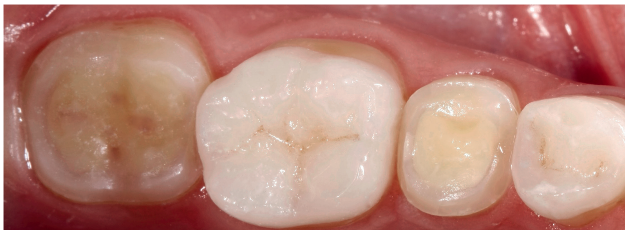
Fig 16 Try-in of the occlusal onlays with Try-In Paste (Ivoclar Vivadent).

teeth were prepared for bonding in the following steps: 1) Silicoating of the areas with composite restorations (CoJet); 2) Etching for 30 s on enamel and 15 s on dentin with 37% phosphoric acid (Ivoclar Vivadent); 3) Rinsing and drying; 4) Coupling agent application on air-abraded areas (Monobond Plus); 5) Adhesive application: scrubbing for 20 s (Adhese Universal); 6) Air cleaning to disperse the adhesive; 7) Light curing of the adhesive for 10 s; 8) Resin cement