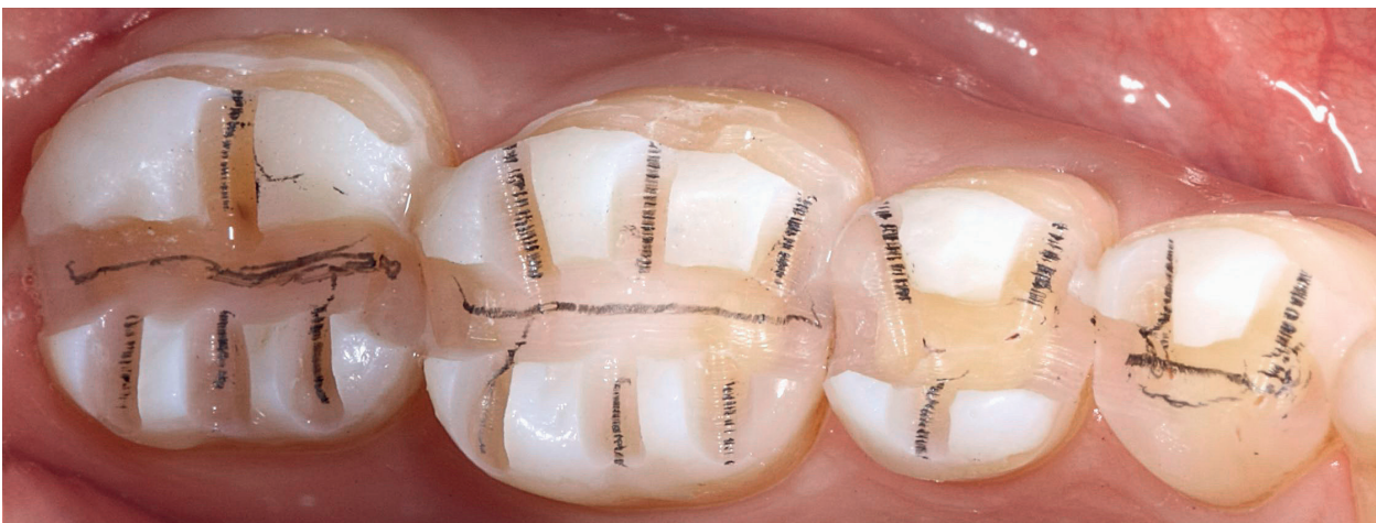
Fig 14 Preparation of the posterior teeth guided by the planning of the wax-up and mock-up.