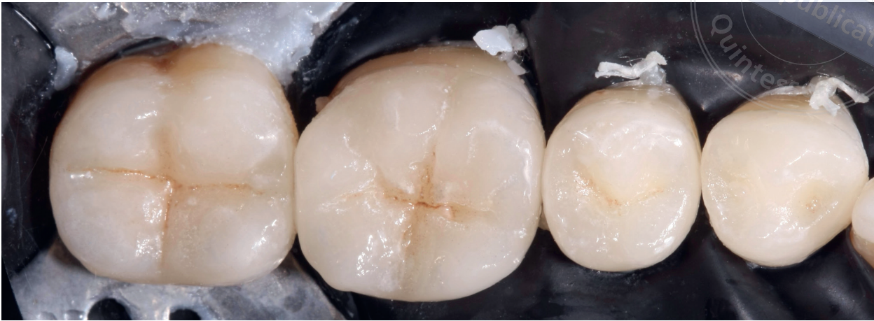
Fig 17 Bonding of the onlays under absolute rubber dam isolation to avoid any contamination with saliva.