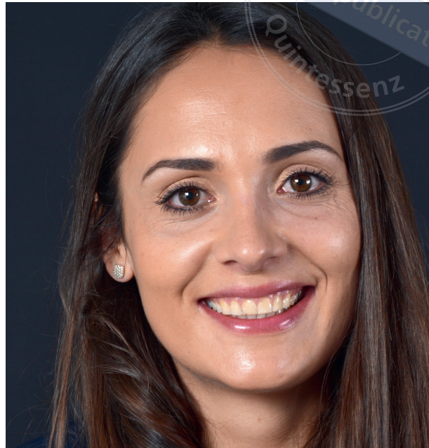
Fig 1 Preoperative appearance of the patient's smile.

A young female patient presented at the Department of Prosthetic Dentistry of the LMU München, complaining about the appearance of her smile (Figs 1 to 4). She presented worn dentition, extremely increased sensitivity to temperature (hot/cold food and drinks), and symptoms in