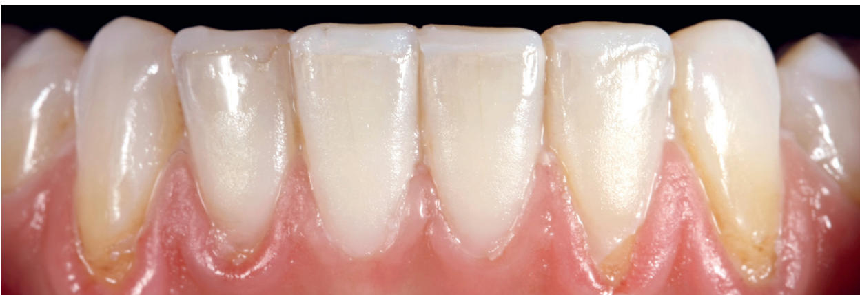
Fig 10 Therapeutic mock-up for the mandibular anterior teeth.