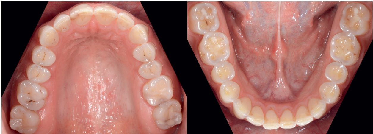
Fig 4 Presence of severe tooth wear on the occlusal surfaces of the posterior teeth with exposed dentin.