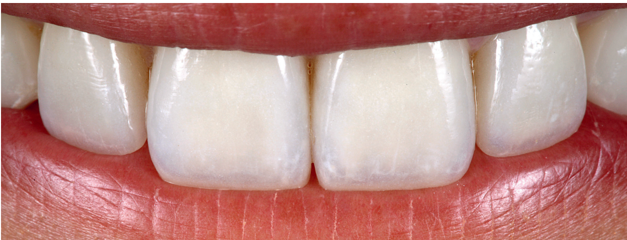
Fig 21 Postoperative appearance of the anterior tooth display in combination with lip dynamics.

tooth wear by categorizing primary and secondary factors as reasons to start a treatment. Primary factors include the amount of tooth wear, the role of the affected surfaces, and whether the wear is localized or generalized. Secondary factors include etiological factors, the speed of wear progression, and the age of the patient. Wear progression can be