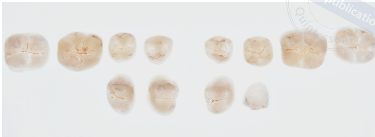
Fig 15 Posterior restorations fabricated from LS2.