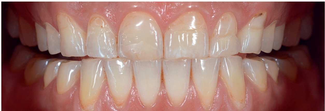
Fig 3 Presence of severe tooth wear on the buccal and incisal surfaces of the anterior teeth.