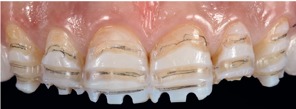
Fig 18 Preparation of the maxillary anterior teeth guided by the planning of the wax-up and mock-up.

phase was initiated with the restoration of the anterior compartment to recover esthetics and function. All six maxillary anterior teeth were prepared following the therapeutic mock-up and depth marking to ensure maximum preservation of healthy dental structure (Fig 18). The mandibular canines were also prepared for veneers, while the mandibular incisors received direct composite build-up restorations (Tetric EvoCeram, Ivoclar Vivadent). The maxillary and