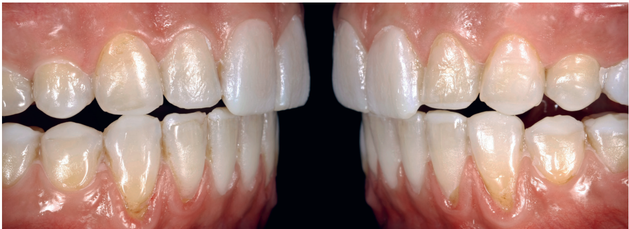
Fig 12 Lateral view of the occlusal situation after receiving the therapeutic mock-up, with the new planned canine guidance.

final light curing for 10 s. The therapeutic mock-ups bonded to the teeth showed the DWU that needed to be restored. The patient was able to adapt to the new increased VDO for 8 to 12 weeks. Within this interim period, no tooth preparations were performed, and the additive mock-up was retained without the occurrence of fractures. The patient reported relief from tooth sensitivity after the exposed dentin had been covered.