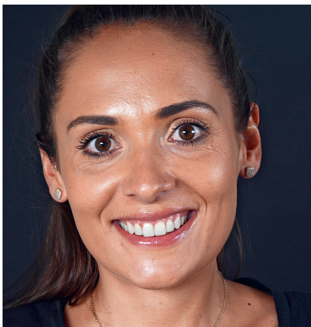
Fig 22 Postoperative appearance of the patient's smile.

monitored by means of sequential impressions and casts or digital scanning of teeth surfaces over time. 2 The assessment of the other primary and secondary factors can also be made over time through clinical examination and a complete anamnesis. 3 The evaluation of these factors, in conjunction with the patient's wishes, should lead to a decision as to whether a restorative intervention should be performed or a preventive approach chosen. In both cases, a careful follow-up of the patient will be necessary.