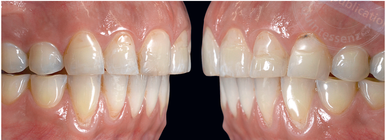
Fig 11 Lateral view of the pretreatment occlusal situation with the lack of canine guidance.