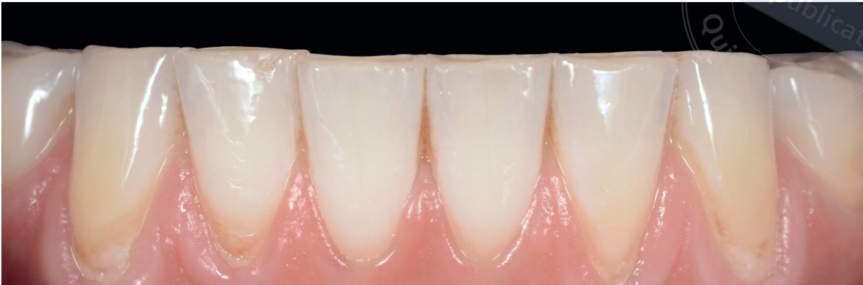
Fig 8 Mandibular anterior teeth before receiving the therapeutic mock-up.