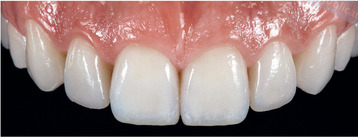
Fig 20 Maxillary anterior teeth after bonding of the veneers.

worn dentition. The decision to perform restorative treatments is mostly based on patients' concern regarding symptomatology (mostly sensitivity), the integrity of their teeth, and the desire to restore the esthetic appearance and recover function. 15 Wetselaar and Lobbezoo 16 have provided a system to help the decision-making process in the management of