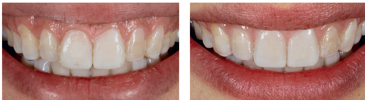
Fig 7 Therapeutic mock-up for the maxillary anterior teeth. Difference between the first and final mock-ups. Corrections involved the shortening of the maxillary right canine, extending the maxillary central incisors, and changing the shape of both maxillary canines.

mock-ups), which was used as a guide for the subsequent treatment steps and final rehabilitation.