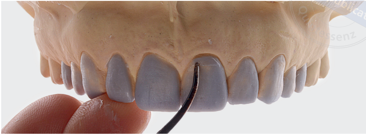
Fig 5 Final adjustments to the DWU, which generated the second wax-up.

dataset. The maxillary and mandibular study models were mounted in CR using a semi-adjustable articulator (Artex CR, Amann Girschbach).