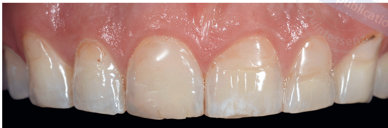
Fig 6 Maxillary anterior teeth before receiving the therapeutic mock-up.